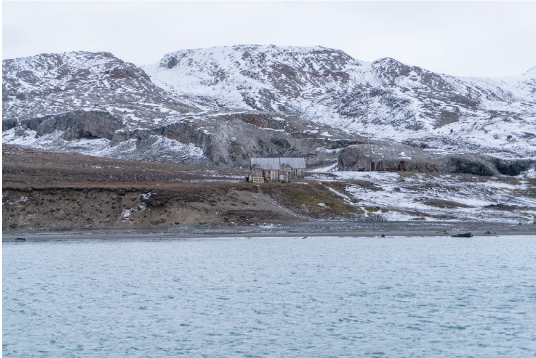
Pete Froslie, Leviathan: Elegy for Ice , 2019. Custom software and electronics, multi-channel video, hydrophone recordings (Arctic ice). Duration: length of exhibition (computer-generated).