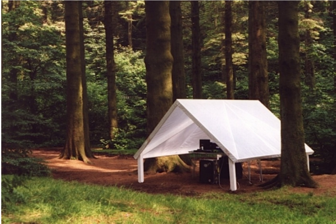
Calum Stirling, Players , 2021. Bespoke data capture units, handmade musical instruments, radio senders and receivers, sound mixing desk, laptop. Sound performance, dimensions variable.