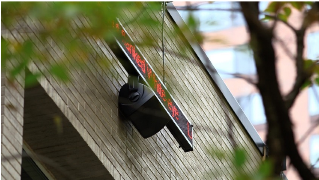
Jenny Kendler, The Playhead of Dawn , 2018. Sound software, LED screens. Dimensions variable.