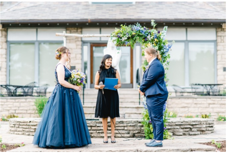
200-300-guest maximum capacity