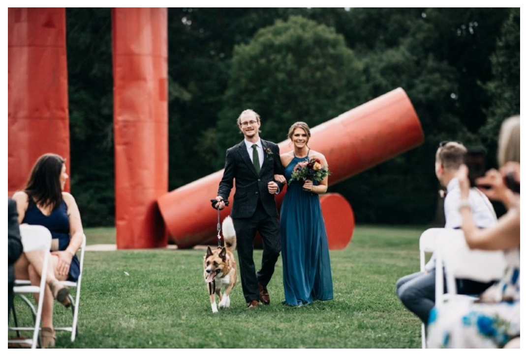
500-guest maximum capacity