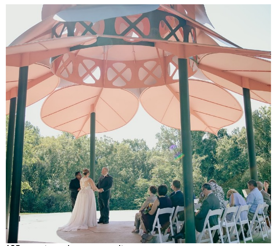
125-guest maximum capacity