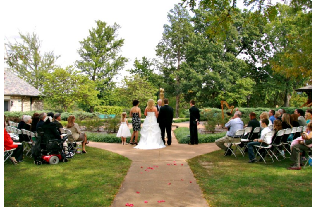
125-guest maximum capacity