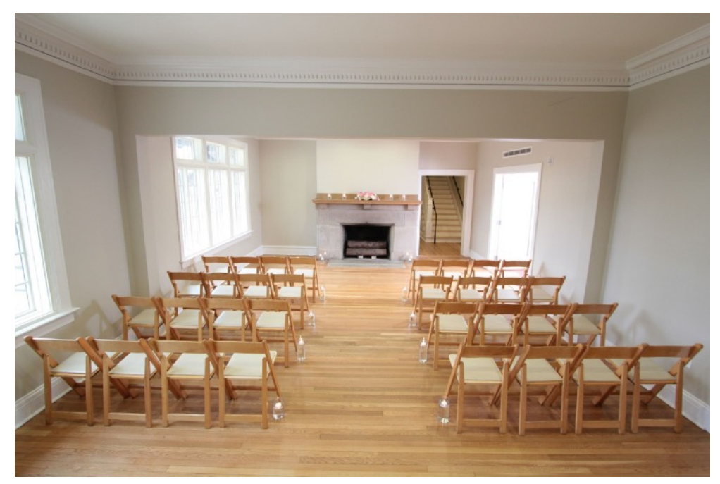
Chairs pictured are not included in the rental fee, but can be ordered by Laumeier Sculpture Park